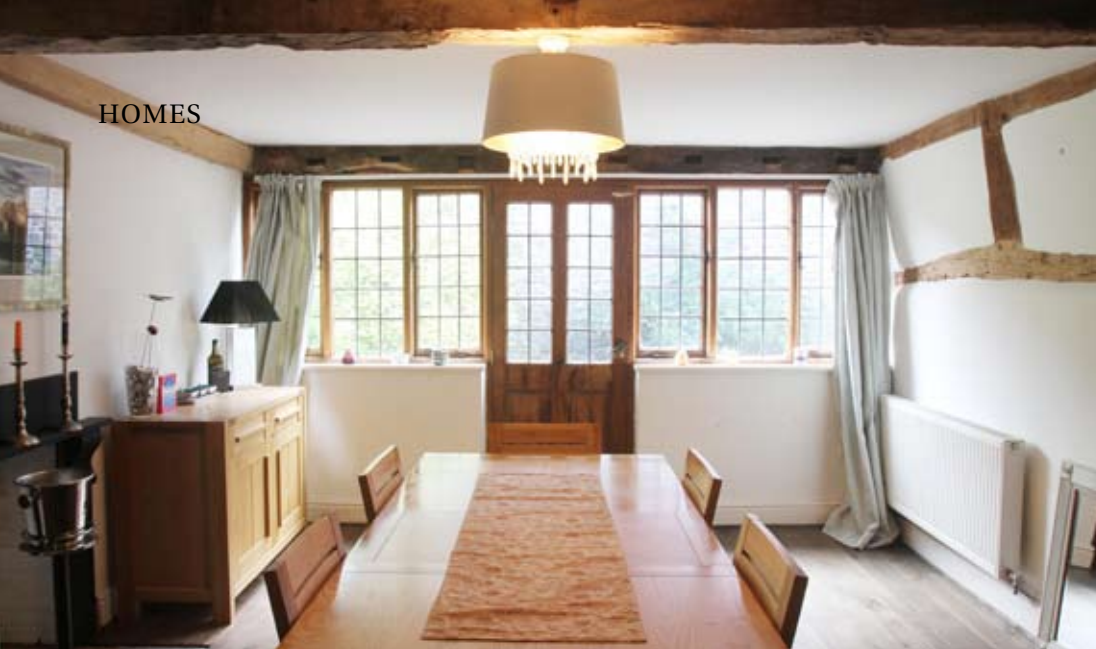
Left: The dining room Below: Westbrook Court's listed barn